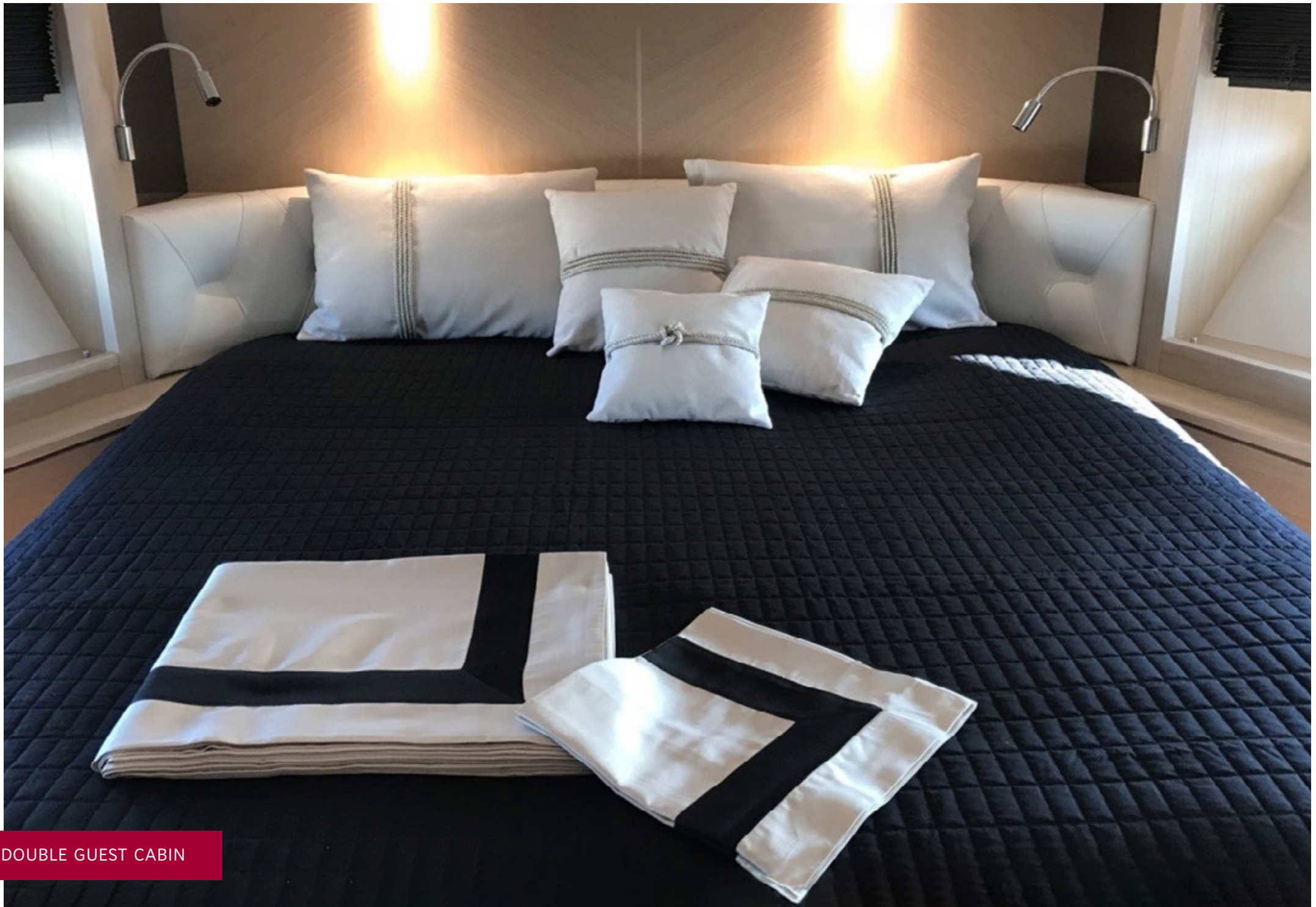
DOUBLE GUEST CABIN